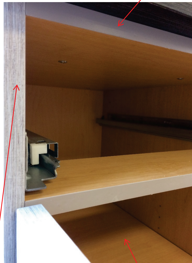
Complimentary PVC banding.