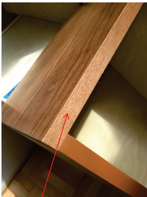
Finished end banding matches door material and finish on wood doors.